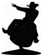
Mechanical Bull Riding