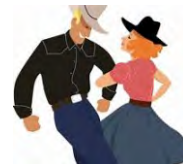
Live Western Band Tops in Arizona

PHYSICIAN / SPOUSE BADGE OR TICKET REQUIRED